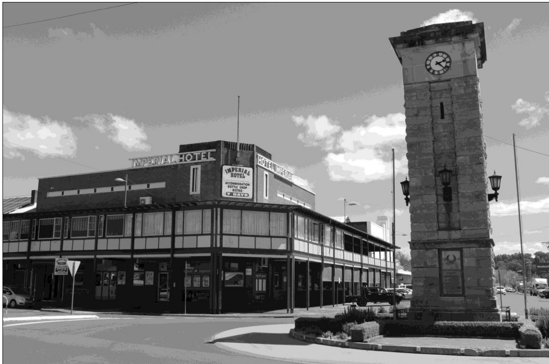
Imperial Hotel and Coonabarabran War Memorial Clock Tower